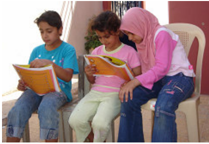
IDPs from Nahr al-Bared reading the Safe You Safe Me Save the Children Publication in a safe-play area in Badawi

Quality education is another key issue Save the Children is working on by establishing a protective system meeting the children's needs, well-being, and rights in accordance with the CRC and protecting their safety in the shelters that included schools, and host families around Badawi. Save the Children Sweden lobbied for an urgent solution to the children in grades 9 to 12 that were presenting their final exams. Save the Children Sweden field-staff also identified three groups of children at high risk in need of remedial education-program, social, and life skills.