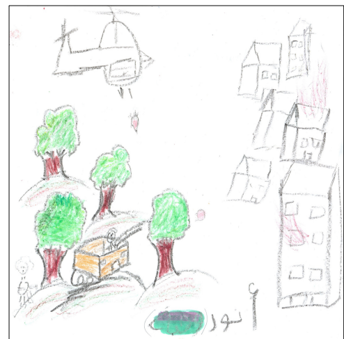
Drawings by children expressing the trauma they went through when living in Nahr al Bared

In celebration of the end of Ramadan, and to mark Save the Children's Day of Action, Save the Children Sweden in partnership with the CPN organized a festival on the 14 th of October called "We are still playing!" targeting 300 children from the Nahr al-Bared and Badawi camps. The activities that took place highlighted the problem of violence against children; however also had a positive element with giant exhibition in the streets of the camp, painting, games, and puppet shows.